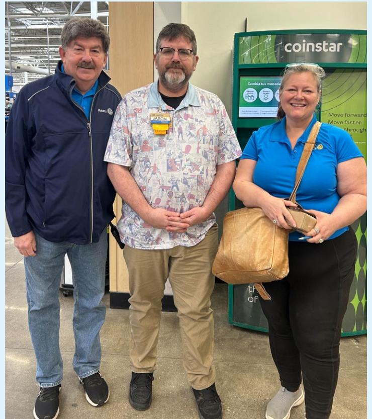
Walmart gave our Rotary Club a $100 gift card for Rotary's Soles-4-Souls project.

Clubs that successfully add 8 new members during the challenge period will be entered into a drawing for $1,000 to host a member social event in May or June. The social event must include members bringing guests, reinforcing Rotary's culture of invitation and fellowship.