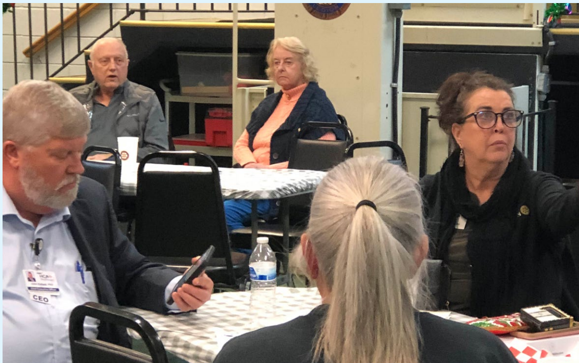
Some scenes from today's meeting