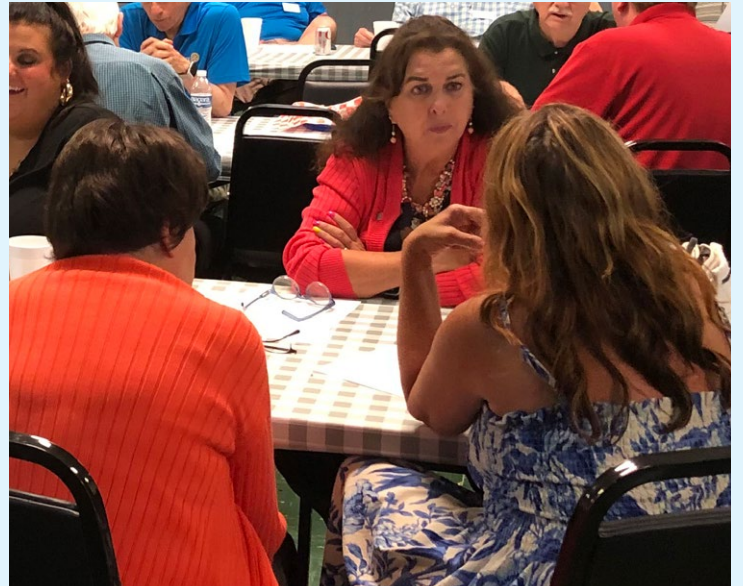
The club broke up into groups for today's program.

The monthly board meeting will be this coming Wednesday, August 21, 2024 following the weekly meeting. Directors/Officers please make every effort to attend and any member who wish to attend are welcome.