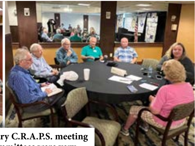
We had a great Rotary C.R.A.P.S. meeting today! All the committees were very engaged and lots of progress was made.