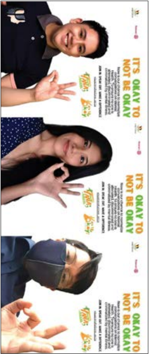
Rotaractors in Southeast Asia created digital posters to spread awareness of their multiclub mental health initiative. (See story inside)

Periodicals Class Postage PAID at FRANKFORT, KY 40601