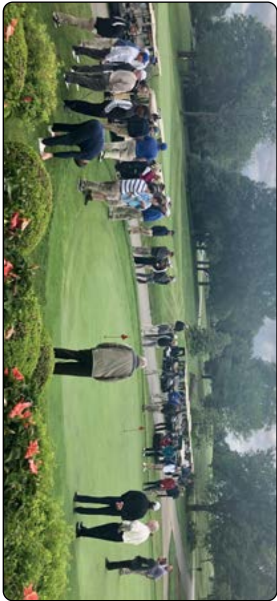
This image is from a previous Rotary Youth Fund Golf Scramble. While this year's scramble has been cancelled, the club – with the help of the Frankfort Plant Board – will still offer the same level of scholarships as in previous years and is seeking donations. Read more inside.

Periodicals Class Postage PAID at FRANKFORT, KY 40601