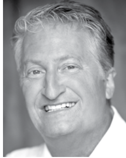
Speaker Andy Andrews

Think of all the ways your club has made a difference this year! We are joining together to celebrate your accomplishments at the District Conference, June 1-2 in Paducah, by highlighting accomplishments both locally and internationally, providing club awards, training officers, completing a service project, and enjoying New York Times best-selling author and business trainer Andy Andrews' topic "Making a Difference."