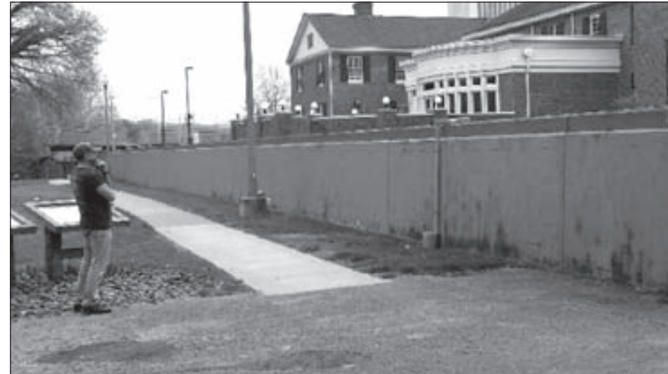
The Club raised money to support the mural project to begin this Summer near the riverfront.