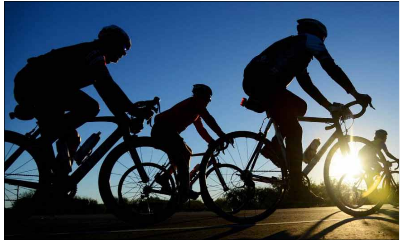
Riders set off on the 2015 El Tour de Tucson in Arizona, USA.

Mark your calendar for Feb. 1 for the monthly make-up meeting at the New China Buffett at 12 noon.