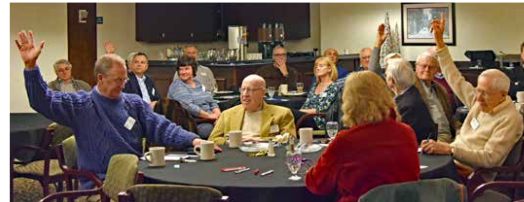
Taking a count to find the winners of the New Year's Resolution's Game.

* Scheduled the next board meeting for January 30, 2017.