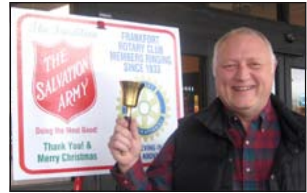
Thanks to all that participated in this year's Salvation Army bell ringing.