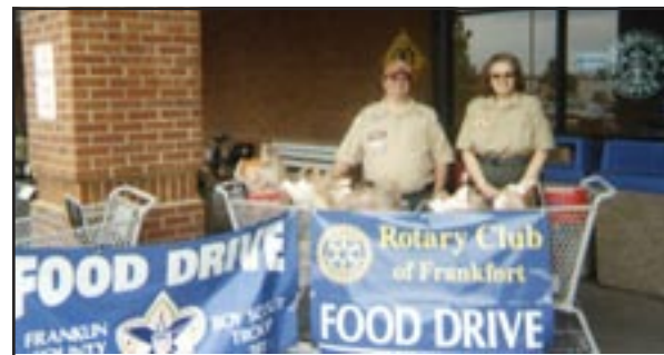
Scout leaders prepare to unload food into truck to collect food at SaveALot East.