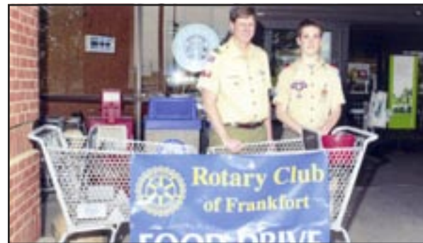
Scout and Scoutmaster collecting food at Kroger East.