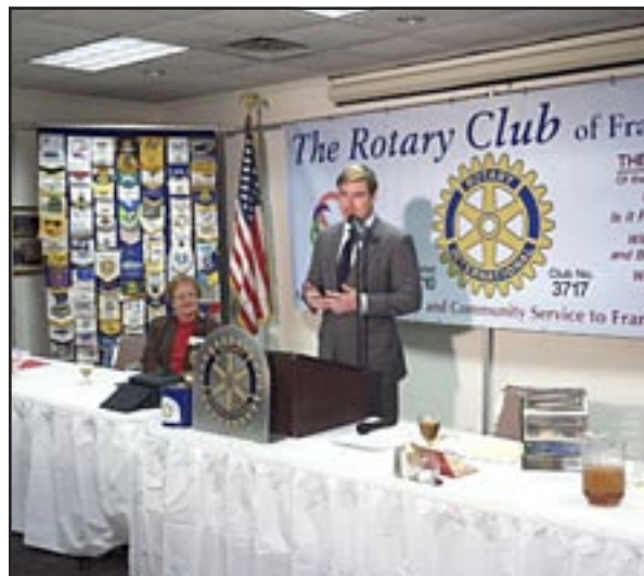
Attorney General Jack Conway was the speaker at today's program