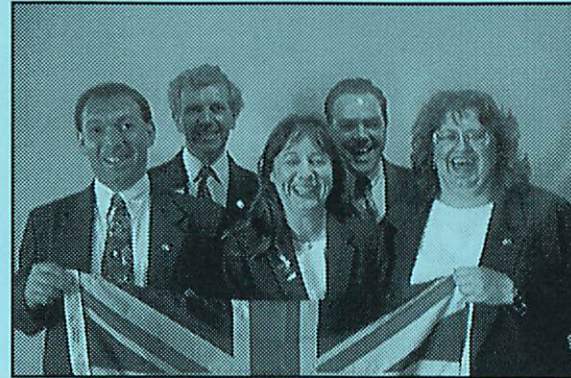
"The Group Study Exchange (GSE) team from England pleasantly entertained the meeting with their discussions of their families and occupations."