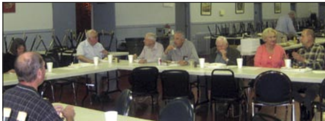
At the VFW make-up meeting, Rotarians shared their remembrances of their mothers in observance of Mother's Day on Sunday.