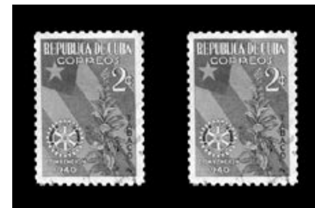
Commemorative stamp issued by Cuba for the 1940 RI Convention in Havana. In 1955, Cuba issued two stamps for Rotary's 50th anniversary.

In 2005, Rotary's centennial inspired stamps from nations including France, Ghana, Peru, and Togo.